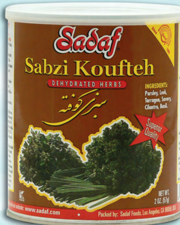
Sabzi Koufteh Item # 14-1387 14-1387-12