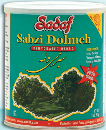
Sabzi Dolmeh Item # 14-1388 14-1388-12