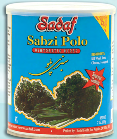
Sabzi Polo Item # 14-1382 14-1382-12