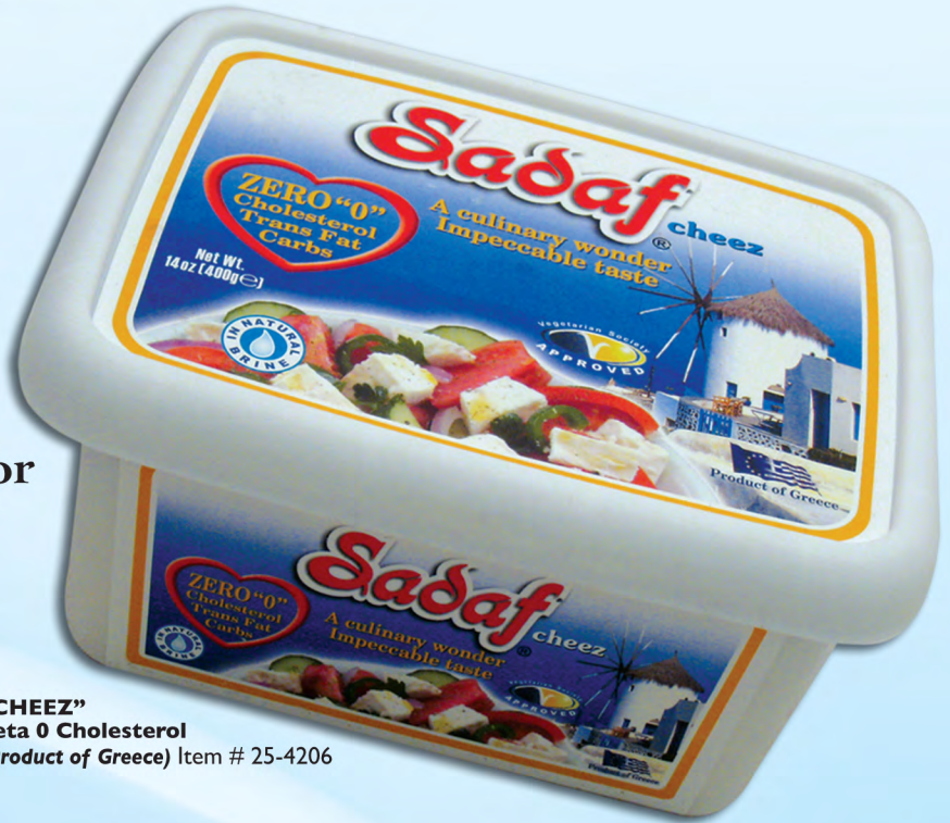
“CHEEZ” Feta 0 Cholesterol (Product of Greece) Item # 25-4206