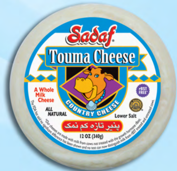
Touma Cheese Lower Salt (Product of USA) Item # 25-4230