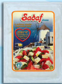
“CHEEZ” Feta 0 Cholesterol (Product of Greece) Item # 25-4202