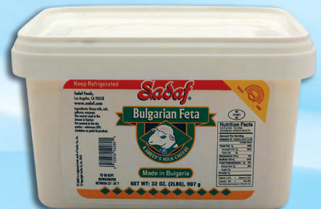
Bulgarian Feta Cheese (Product of Bulgaria) Item # 25-4280