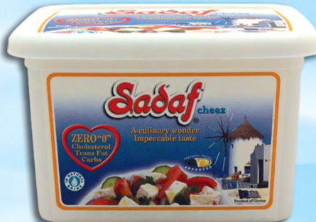
“CHEEZ” Feta 0 Cholesterol (Product of Greece) Item # 25-4210