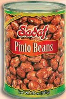
Pinto Beans Item # 30-3140