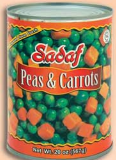
Peas & Carrots Item # 30-3146