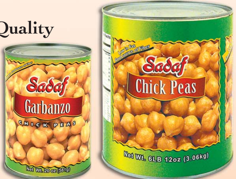
Garbanzo ( Chick Peas) Item # 30-3134