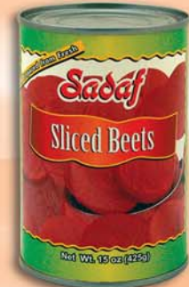
Sliced Beets Item # 30-3154