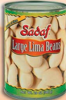
Large Lima Beans Item # 30-3137