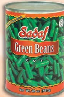
Green Beans, Cut Item # 30-3148