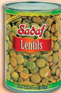
Lentils, Green Item # 30-3152