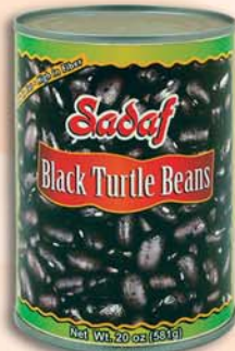
Black Turtle Beans Item # 30-3147