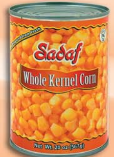
Whole Corn Kernel Item # 30-3158