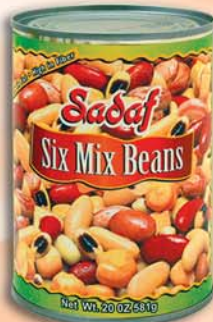
Six Mix Beans Item # 30-3138