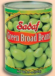
Green Broad Beans Item # 30-3133