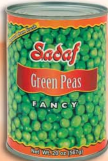
Green Peas, Fancy Item # 30-3150