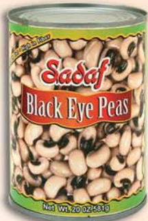
Black Eye Peas Item # 30-3130