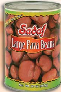
Large Fava Beans Item # 30-3132